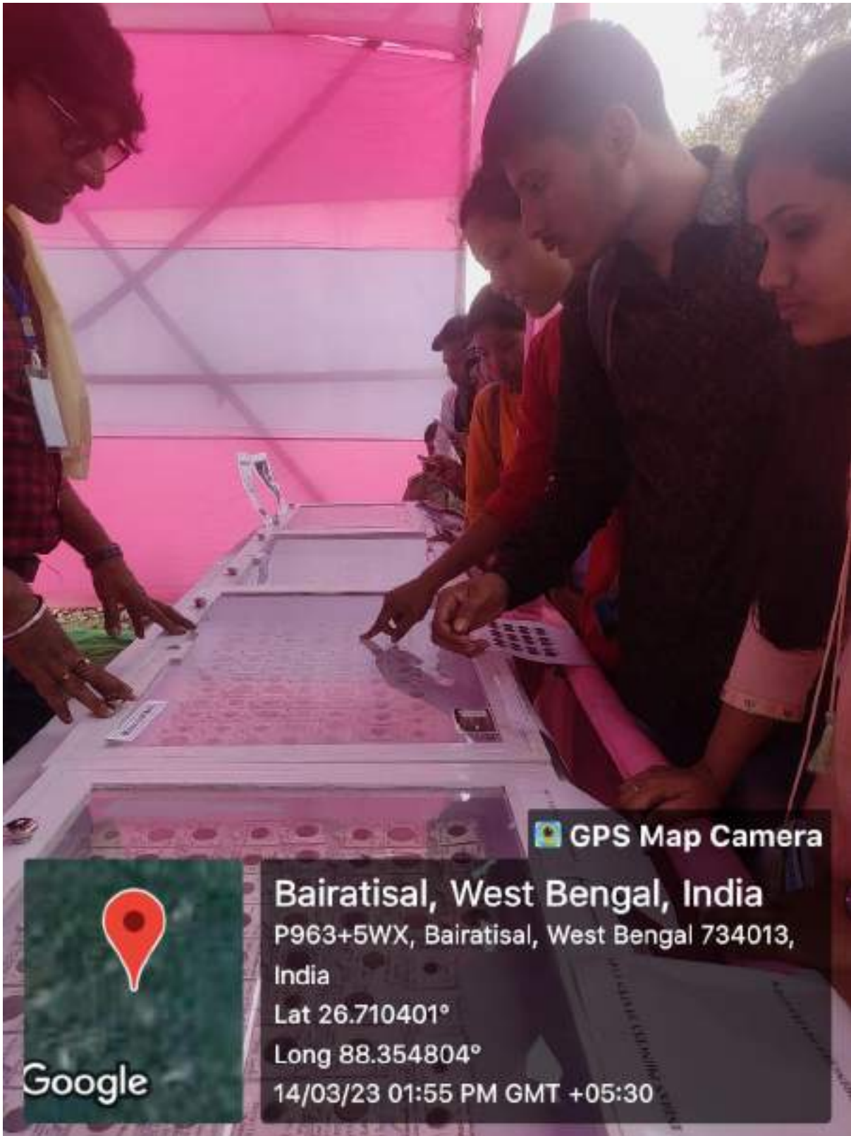
(Educational Tour at the University of North Bengal on 14.03.2023)

The visit not only served as one educational experience but also provided a practical application of the theoretical knowledge acquired during their course work. Students were encouraged to ask questions that promoted critical thinking and curiosity. Students were also